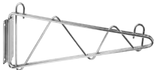
VCB-SERIES WALL MOUNT BRACKET