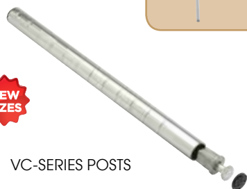
NSF VC-SERIES POSTS