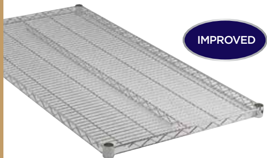
NSF VC-SERIES SHELVES